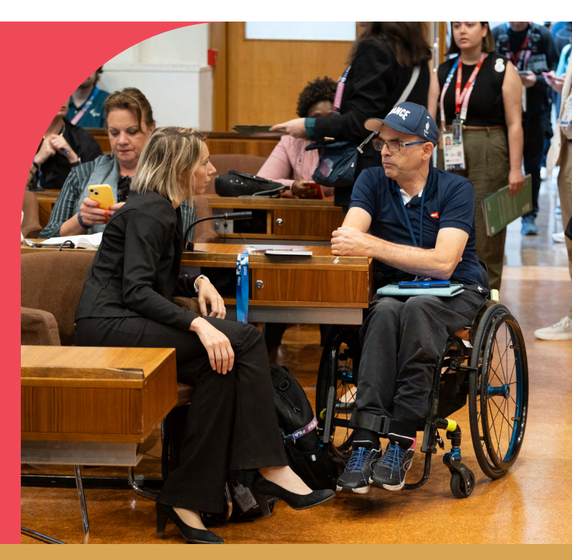
International Disability Inclusion Conference

Two successful biennial international conferences in adapted physical activity are coming together as one under the patronage of UNESCO and organised by the UNESCO Chair, MTU Kerry, Ireland. The pan disability conference covers all areas of disability. Up to 600 delegates are expected from academia, international organisations, government and local government, civil society, and the private sector come together to learn about and share developments relevant to adapted physical activity. Our trade exhibition will be very much part of the ISAPA2025 delegate experience. We will ensure exhibitors can engage with delegates across the week. Up to 60 exhibitors, will showcase innovations, products and services to advance the field of APA.