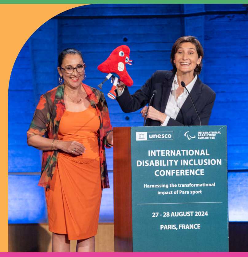
International Disability Inclusion Conference

More than 1.3 Billion people, over 15% of the world's population, live with disability. Yet disability inclusion as a social movement is often misunderstood, overlooked and underfunded. Persons with disabilities face many structural, educational, financial, environmental and attitudinal barriers that hinder their full and equal participation in society.