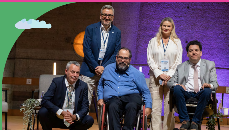
International Disability Inclusion Conference

If your product, service or innovation applies to any area of disability be it physical, sensory, autism, ADHD, psychosocial or mental health difficulties, intellectual or cognitive, visual impairment, deafness, hearing impairment, deafblindness, myalgic encephalomyelitis/ chronic fatigue syndrome you need to be at ISAPA2025.