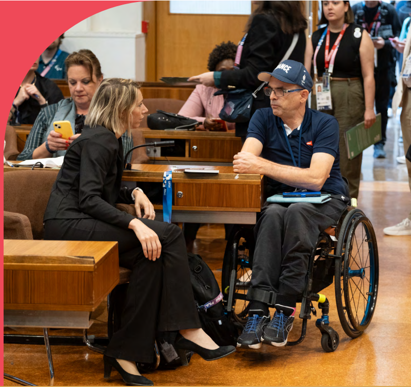
International Disability Inclusion Conference

Two successful biennial international conferences in adapted physical activity are coming together as one under the patronage of UNESCO and organised by the UNESCO Chair, MTU Kerry, Ireland. The pan disability conference covers all areas of disability. Up to 600 delegates are expected from academia, international organisations, government and local government, civil society, and the private sector come together to learn about and share developments relevant to adapted physical activity. Our trade exhibition will be very much part of the ISAPA2025 delegate experience. We will ensure exhibitors can engage with delegates across the week. Up to 60 exhibitors, will showcase innovations, products and services to advance the field of APA.