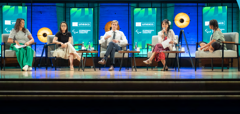
International Disability Inclusion Conference

need France to hear this. Yes, it is okay to be different. Sports and dance and basic of the three really go together, have been fundamentals for us. countless